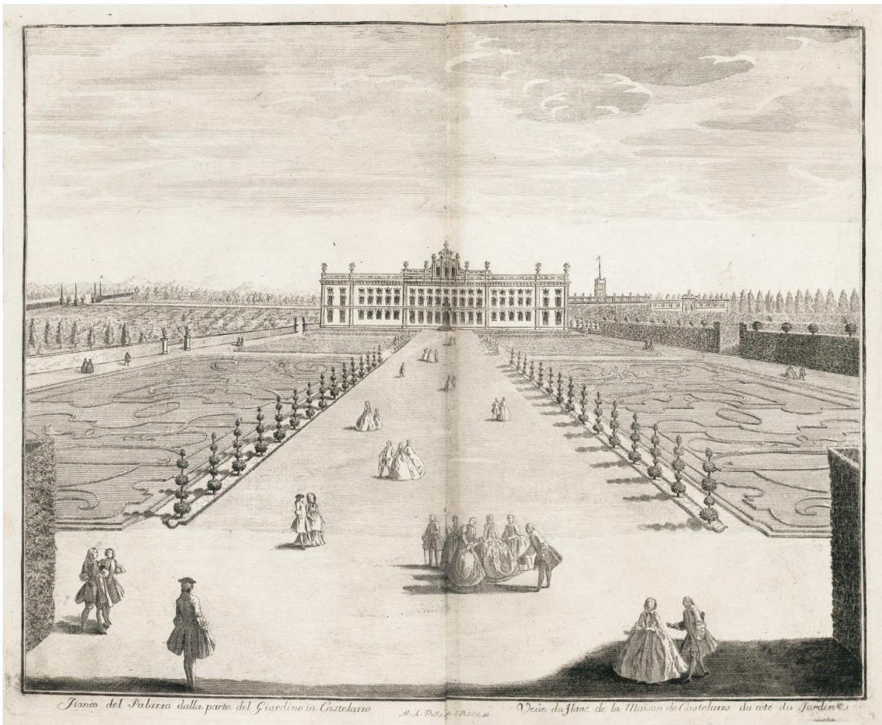
The parterre in the eighteenth-century engraving by Marc'Antonio Dal Re

The scenographic effect of this garden is underlined by two elements: the first is represented by hornbeam plants, which are pruned following the dictates of the topiary in the form of a "ballerina", that is, with the rounded top as if it were a small head and flounces of greenery to remember the tutu of the classical dancers.