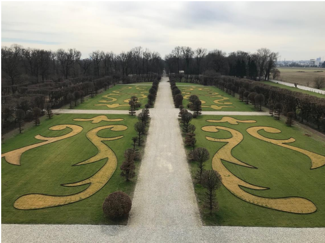
Parterre of Villa Arconati-FAR, restoration in progress

The restoration of the parterre is undoubtedly one of the most impressive made by FAR for the recovery of the monumental garden: the efforts made, and not yet concluded, will certainly be rewarded by the satisfaction of having brought back one of the very few French-style gardens in Lombardy to its former splendor!