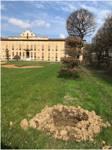
Hole for relocation of hornbeam plant