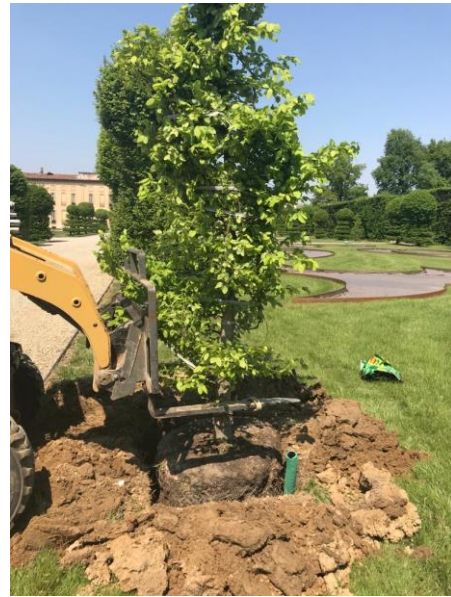
Planting of new hornbeam

The restoration of the parterre is undoubtedly one of the most impressive made by FAR for the recovery of the monumental garden: the efforts made, and not yet concluded, will certainly be rewarded by the satisfaction of having brought back one of the very few French-style gardens in Lombardy to its former splendor!